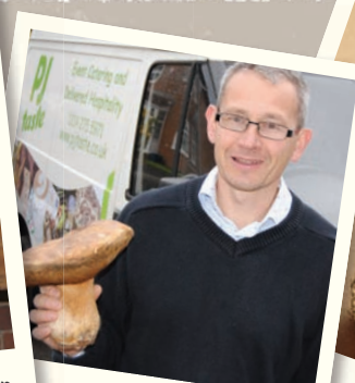
PJ Taste fungal treats